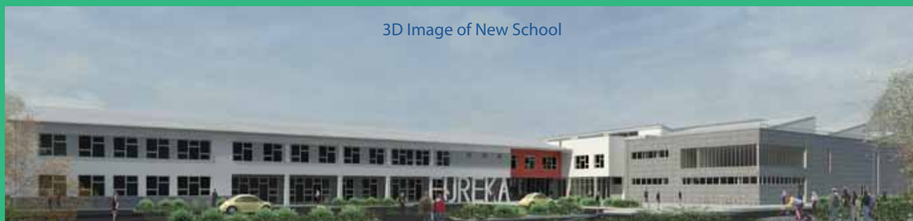
3D Image of New School

We are pleased to announce that our new school is due for completion at the end of 2016! It will consist of a state-of-the-art two-storey building on the Cavan Road and will cater for a student population of 800, serving the town of Kells and its hinterland.